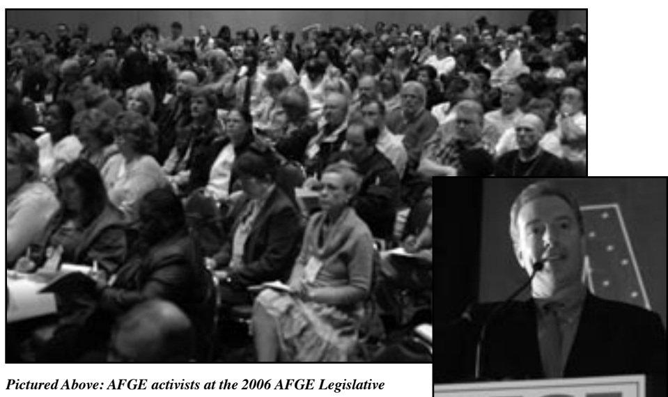
Conference. Inset: Congressman Chris Van Hollen (D-MD) addresses Conference attendees.